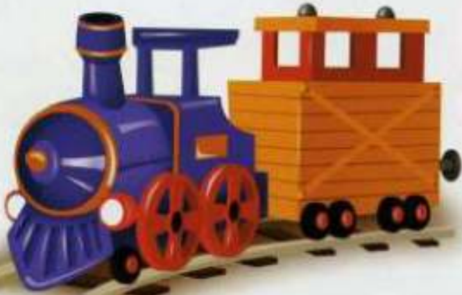
1. a train