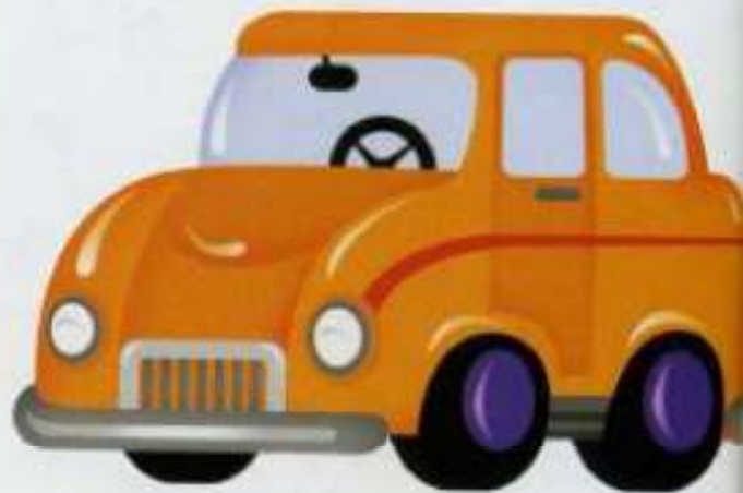
2. a car