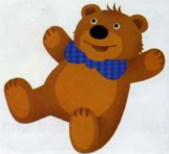
4. a teddy bear