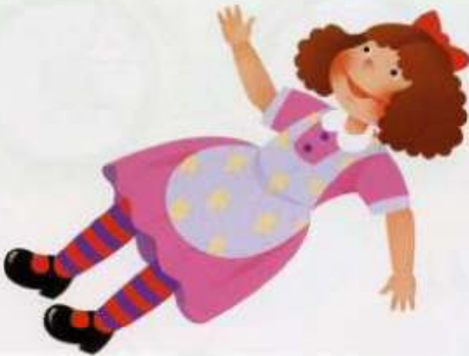
3. a doll